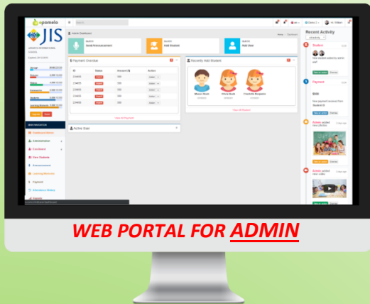
WEB PORTAL FOR ADMIN

A Mobile Apps And Web Based Interactive Cloud Solution For Education Center Management