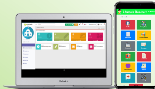
WEB PORTAL & MOBILE APP FOR TEACHERS

Web for the school admin to manage staff users, students' profiles, school profiles, send announcements, payments reminders, view reports, and do many other tasks